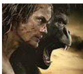
← Legend of Tarzan poster