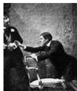
The Importance of Being Earnest being performed -->

“It is what you read when you don't have to that determines what you will be when you can't help it.”— Oscar Wilde: Irish playwright, novelist, essayist, and poet